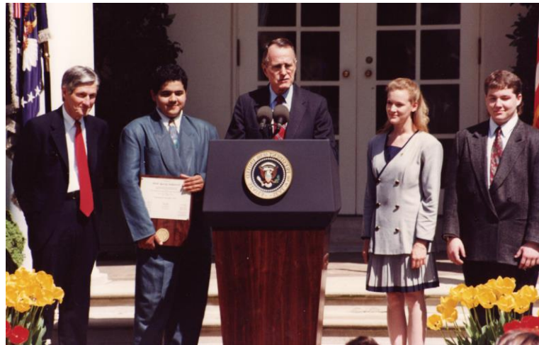
National Winners from Texas visit President George Herbert Walker Bush at the White House on April 23, 1992.