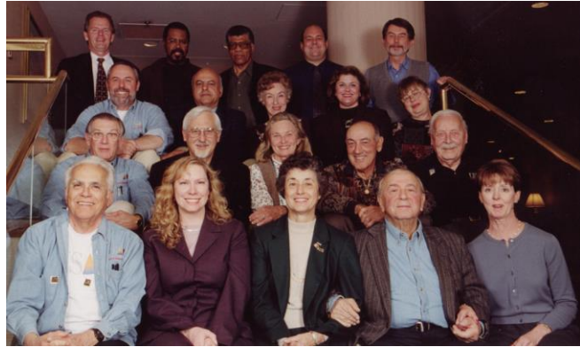
USAD Board of Directors at the National Competition in San Antonio, Texas in 2000.