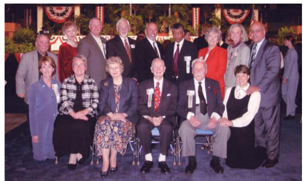
USAD Board of Directors in Erie, Pennsylvania in 2003.

Upon the advice of the Field Committee, a procedures manual was developed for the USAD National Competition in 2003. The manual was designed to serve as a guide for those involved in the planning and administration of the USAD National Competition. It listed the responsibilities of the host state and the competition coordinator. USAD and the host state would share the responsibility for all competition and contractual arrangements, including hotels and other venues, for the National Competition. The host state was responsible for organizing support at the local level, including volunteers, judges, transportation, entertainment and social events. The recommendation that USAD rotate the location of the National Competition to different geographic areas was implemented in 2003.