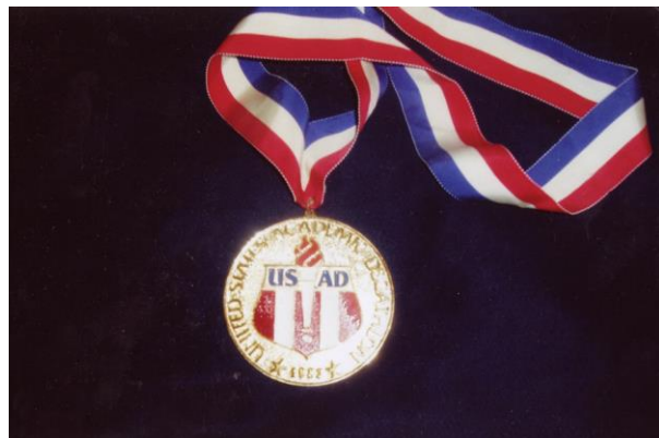
The Academic Decathlon Medal--- A Medal of Honor!!