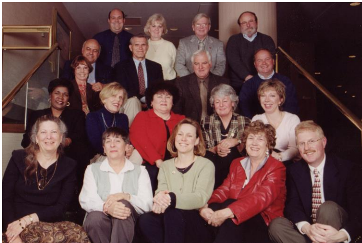
Pictured are the United States Academic Decathlon State Directors at the National Competition in 2000 in San Antonio.