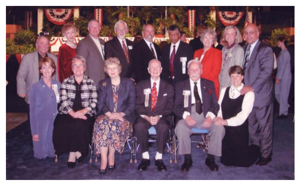
USAD Board of Directors in Erie, Pennsylvania in 2003.

Upon the advice of the Field Committee, a procedures manual was developed for the USAD National Competition in 2003. The manual was designed to serve as a guide for those involved in the planning and administration of the USAD National Competition. It listed the responsibilities of the host state and the competition coordinator. USAD and the host